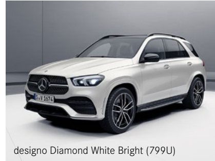
designo Diamond White Bright (799U)