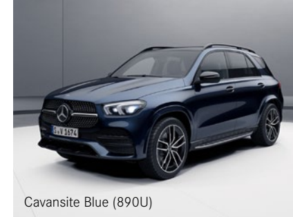
Cavansite Blue (890U)