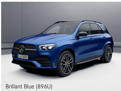
Brilliant Blue (896U)