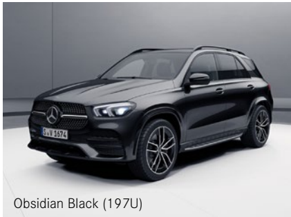
Obsidian Black (197U)