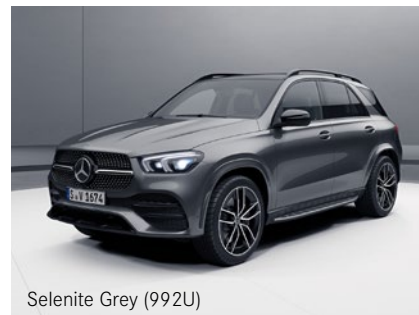
Selenite Grey (992U)