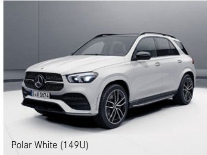
Polar White (149U)