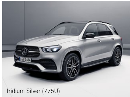
Iridium Silver (775U)