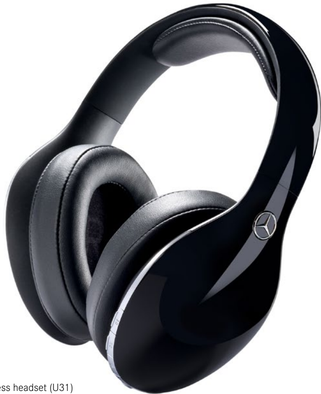
Wireless headset (U31)