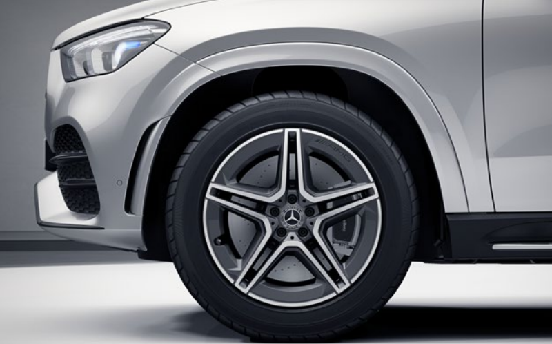
50.8 cm (20") AMG 5-twin-spoke light-alloy wheels (RZV)