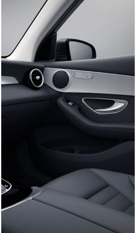
Brushed aluminium trim with light longitudinal grain (H46)