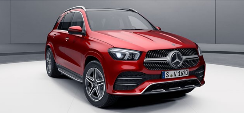
AMG Bodystyling (772)