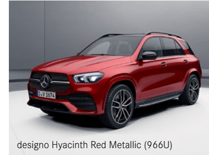
designo Hyacinth Red Metallic (966U)