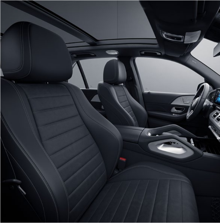
DINAMICA microfibre black (601A) | Roof liner in black fabric (51U)