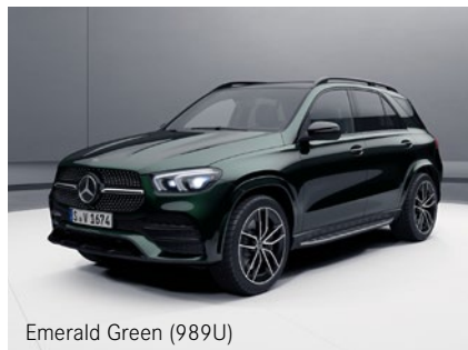
Emerald Green (989U)