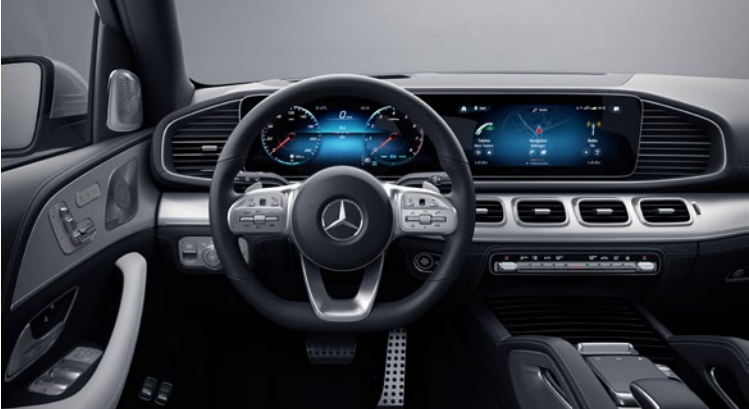
Multifunction sports steering wheel in nappa leather (L5C) | Interior Chrome package (901)