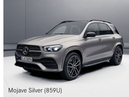
Mojave Silver (859U)