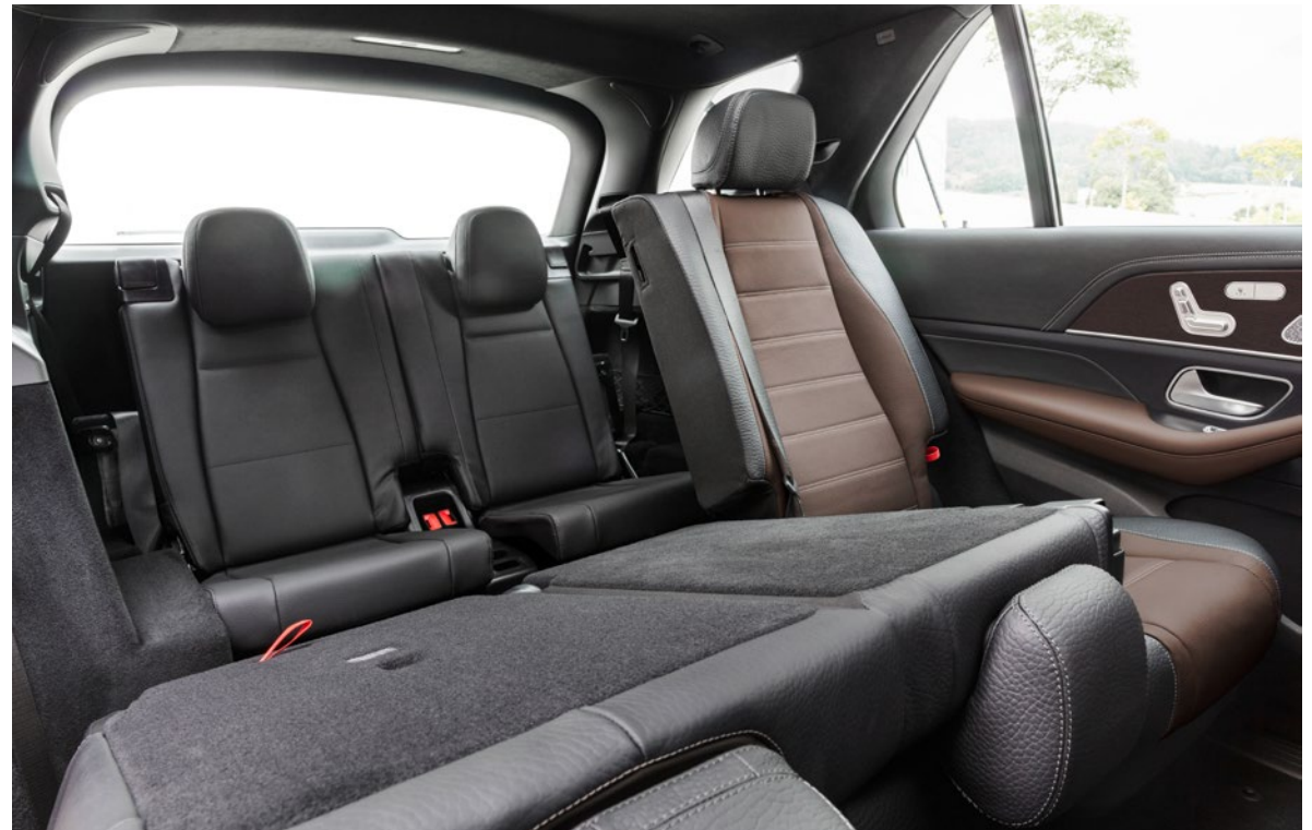
3rd row of seats (847) | Rough leather espresso brown/magma grey, brown open-pore walnut wood trim (201A/H22)