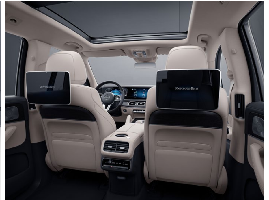
Cavansite blue (890U) | 55.9 cm (22") AMG 5-twin-spoke light-alloy wheels (RXT) | AMG Line exterior (P31) | Night package (P55) | MBUX Rear Seat Entertainment System (864)