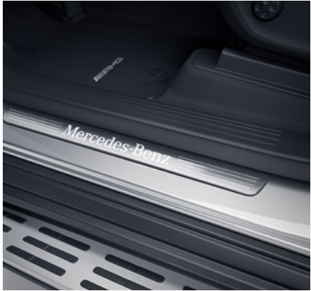
AMG floor mats (U26)