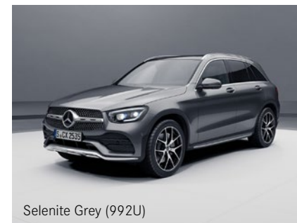
Selenite Grey (992U)