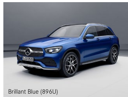
Brilliant Blue (896U)