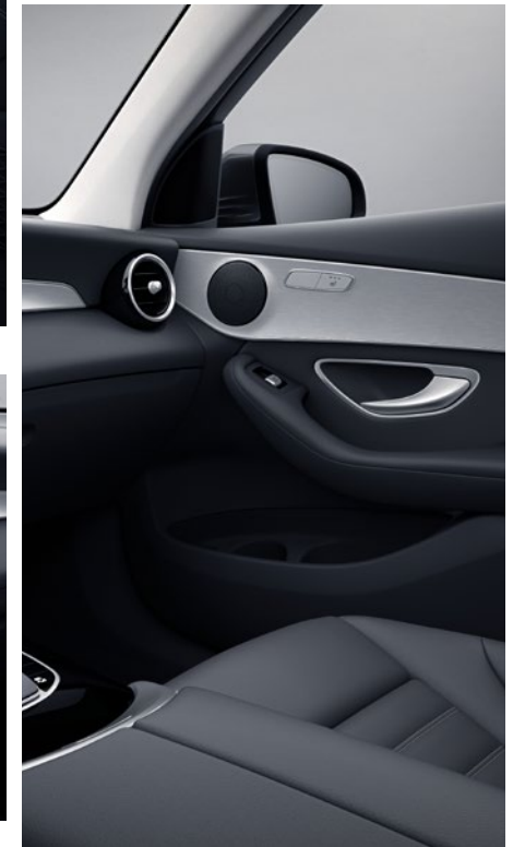
Light longitudinal-grain aluminium trim (739)