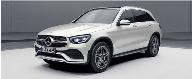
DYNAMIC SELECT(B59) | Sports suspension (486)