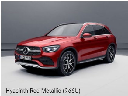
Hyacinth Red Metallic (966U)