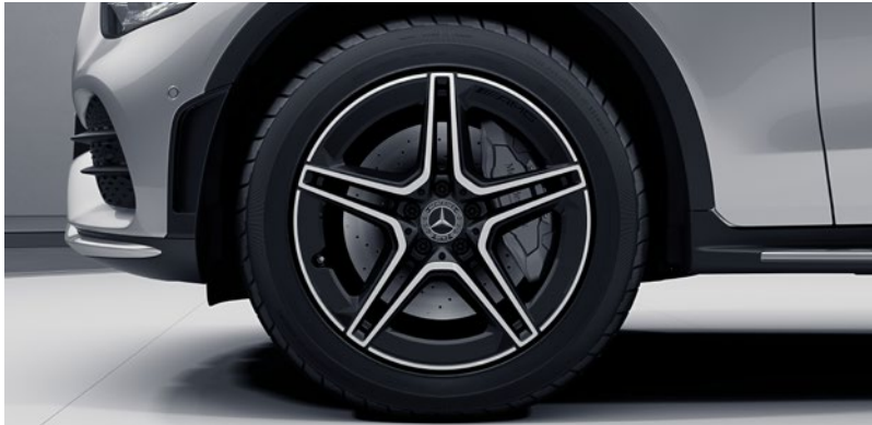
48.3 cm (19") AMG 5-twin-spoke light-alloy wheels (RTG)