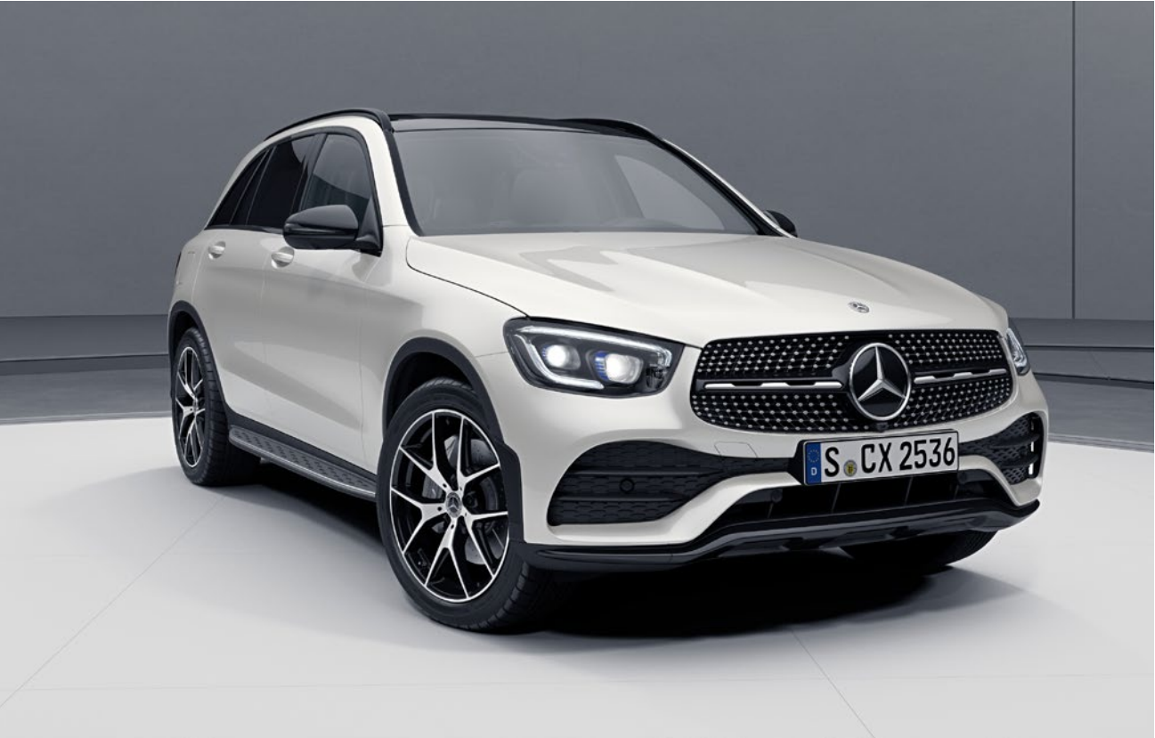
designo diamond white bright (799U), 50.8 cm (20") AMG 5-twin-spoke light-alloy wheels (RTX), AMG Line exterior (P31), Night package (P55)