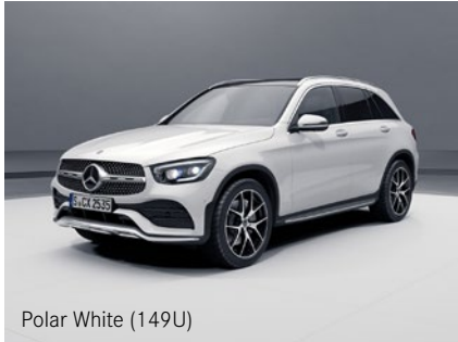
Polar White (149U)