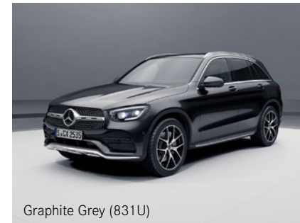
Graphite Grey (831U)