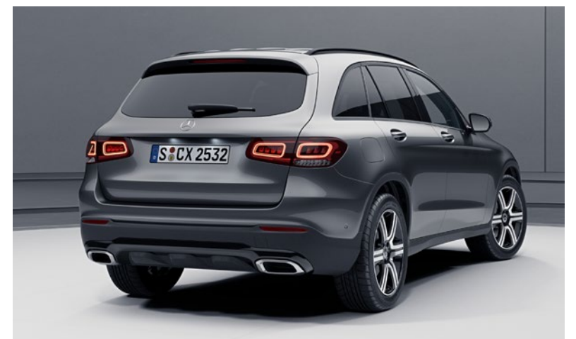
selenite grey (992U), 48.3 cm (19") 6-spoke light-alloy wheels (R18), Standard exterior equipment and appointments (P76), Night package (P55)