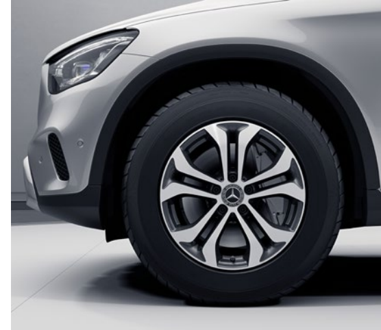
43.2 cm (17-inch) 5-twin-spoke light-alloy wheels (R04)