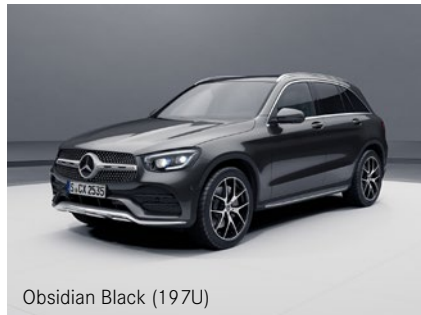
Obsidian Black (197U)