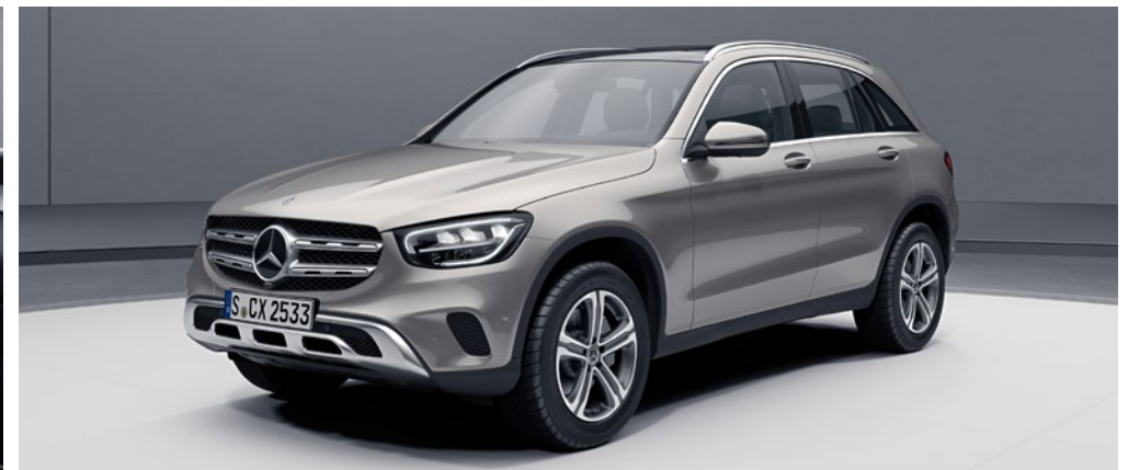
Mojave silver (859U) | 45.7 cm (18") 5-spoke light-alloy wheels (R31) | OFF-ROAD exterior (U89)