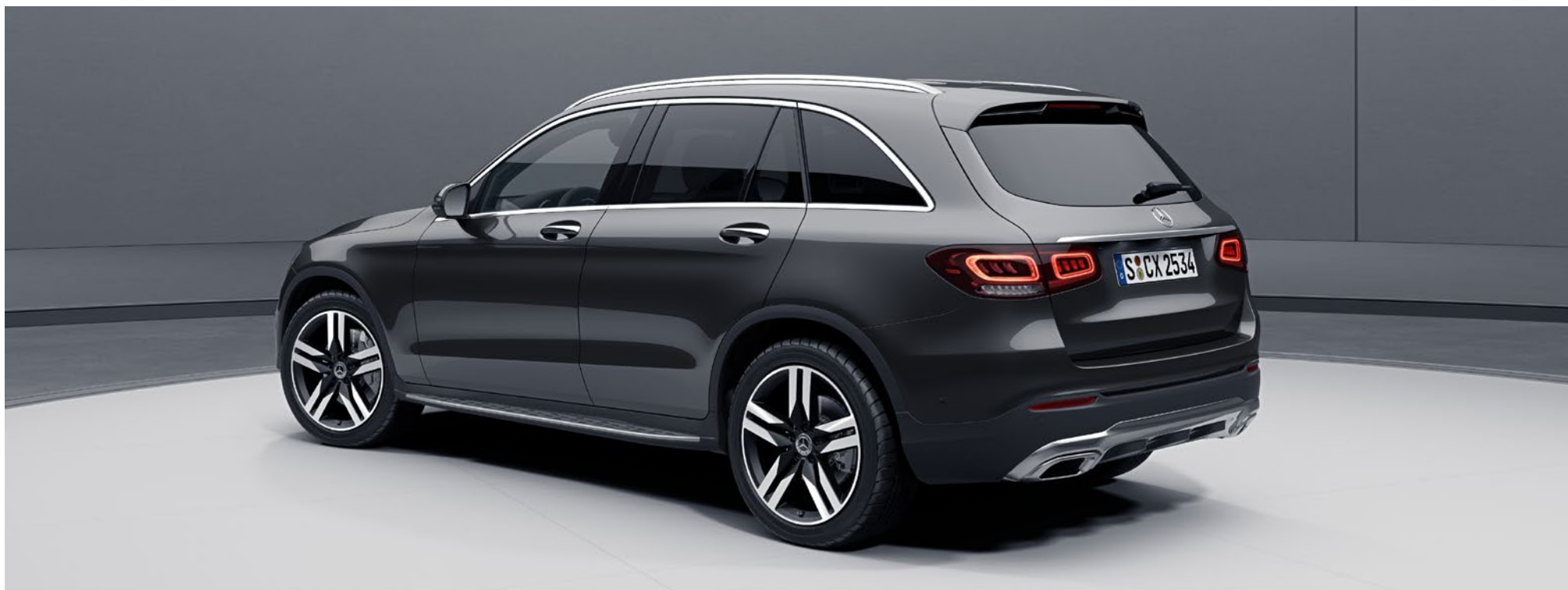
Graphite grey (831U) | 50.8 cm (20") 5-twin-spoke light-alloy wheels (30R) | aluminium-look running boards with rubber studs (846) | Standard exterior equipment (P76) | Heat-insulating dark-tinted glass (840)

In conjunction with P55 R 33,200 In conjunction with U89 R 18,000 R 21,200