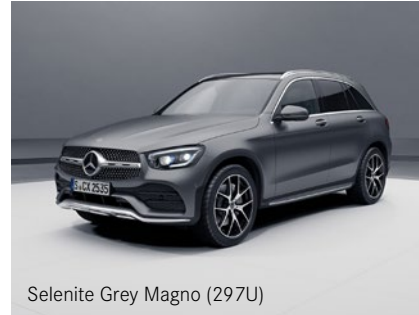
Selenite Grey Magno (297U)