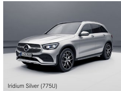
Iridium Silver (775U)