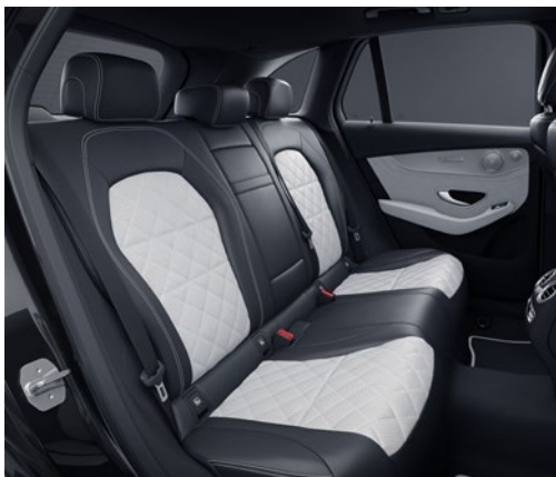
designo two-tone nappa leather platinum white pearl / black (975A)