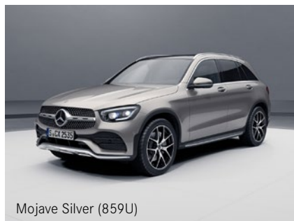
Mojave Silver (859U)