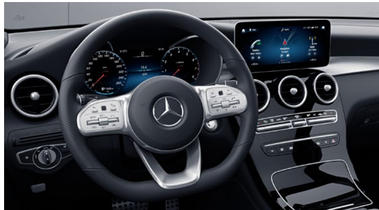
Multifunction sports steering wheel in nappa leather (L5C) | DIRECT SELECT shift paddles (431)