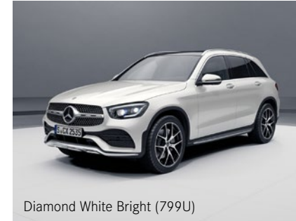
Diamond White Bright (799U)