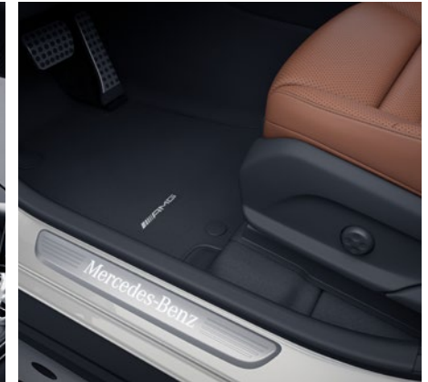
AMG floor mats (U26)