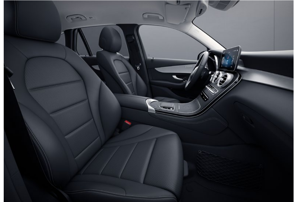
ARTICO man-made leather black (101A) | Double cup holder (309)