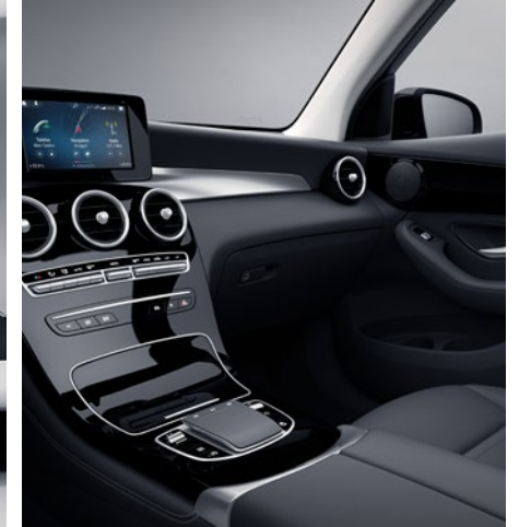
black piano-lacquer-look trim (H80)