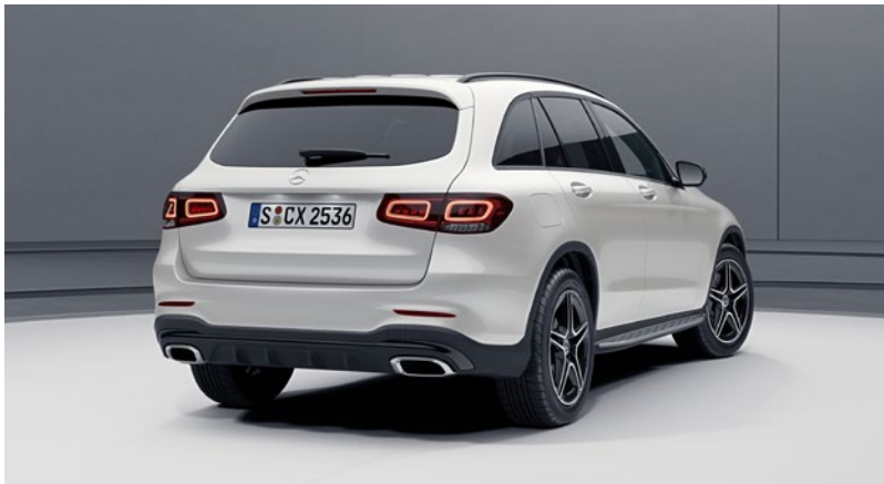
AMG bodystyling (772)