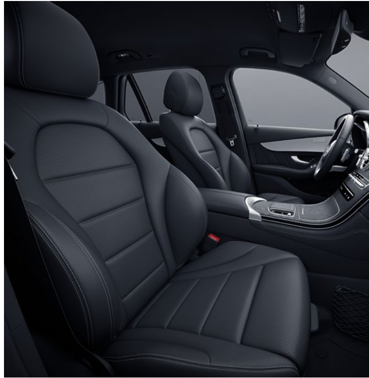
ARTICO man-made leather black (161A)