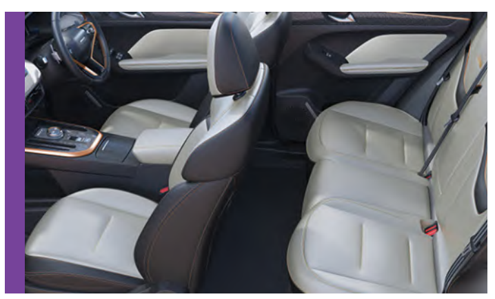
Black and Grey